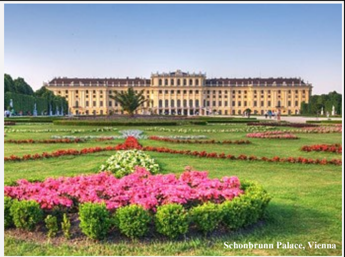
Schonbrunn Palace, Vienna

Not Included: Lunches and beverages not mentioned, Tips to Guide and Driver.